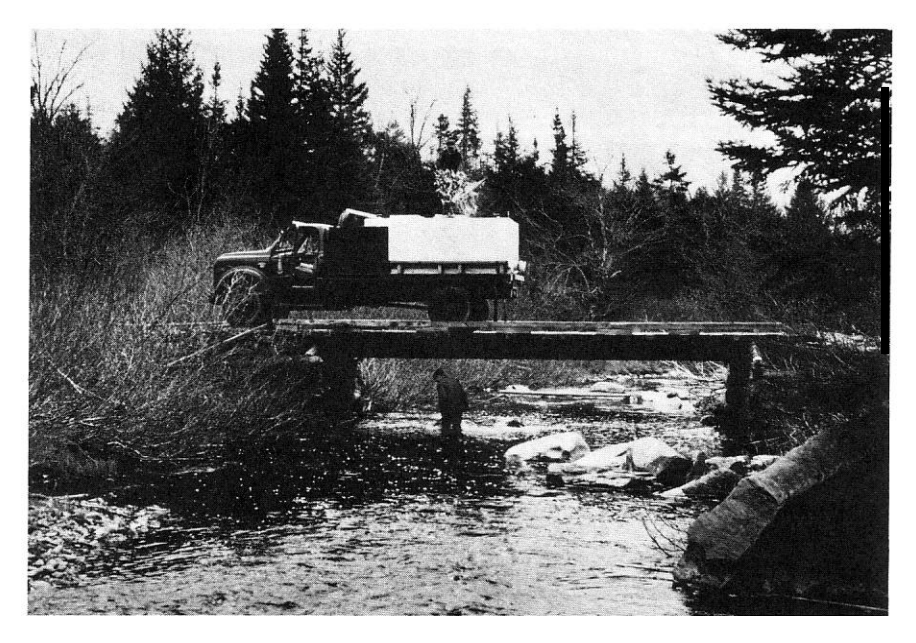
Releasing hatchery-reared salmon to supplement natural populations (T G. Carey)

across considerable distances from a disease source. Consequently, a fish culturist who has worked hard to minimize risk of disease outbreaks in his facility may have his efforts negated by a less conscientious operator upstream of his facility. Similarly, the production of vaccines, fish feeds, and therapeutic chemicals is beyond the control of individual hatchery operators. Therefore, the fish health risks introduced through the use of such products should be reviewed and minimized by governments.